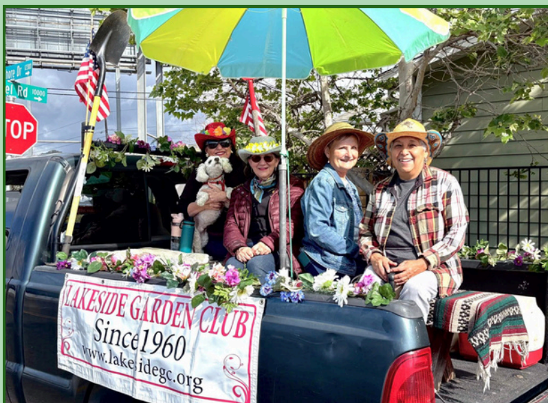
Our float at the Lakeside Rodeo Parade on 4/26/2025